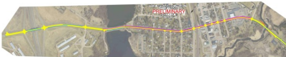
Hwy 87— City of Frazee project limits.

The urban Highway 87 project is scheduled for the 2022 construction season. It includes roadway resurfacing, ADA improvements, shared-use path construction and city utility replacements from south of the Highway 10 interchange to North River Drive in Frazee.