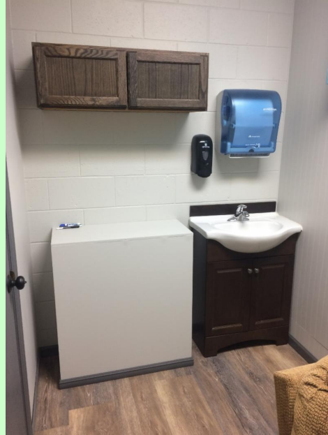
New Mother's Room at Northern Contours

As employers support new mothers, it's important to recognize workplace leaders who see the value to their businesses, their employees and the community.