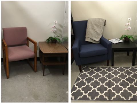
Mothers' room upgrades at Fergus Falls Public Schools

to do so once they return to work. To advance these efforts, PartnerSHIP 4 Health (PS4H) integrates breastfeeding support into its Worksite Wellness initiative. The incentive for businesses is clear: Supporting breastfeeding at work can provide as much as a 3:1 return on investment as a result of reduced healthcare costs, reduced employee absenteeism related to healthier babies, lower turnover, and higher productivity.