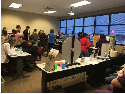
EHDI Health Screening