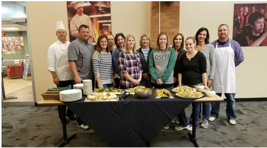
OSPTI staff prepared a healthy meal with NDSCS students