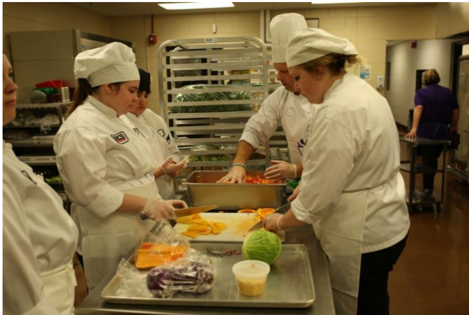
Culinary students begin prepping the roasted vegetables.