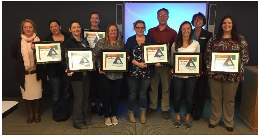
PS4H's 2017 Worksite Wellness Partners