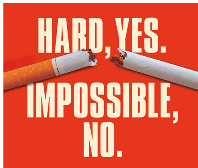
Great American Smokeout November 16.

You're taking an important step toward creating a healthier life when you set out to quit smoking. A good plan can help you get past symptoms of withdrawal. Take these five steps