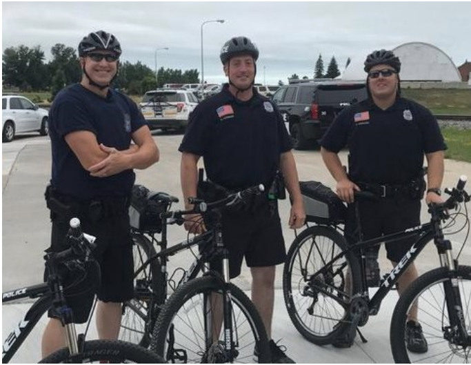
Detroit Lakes officers show off their new bikes.

relations. Departments that use patrol bikes also find them more useful than squad cars in dense pedestrian environments such as festivals and other community events.